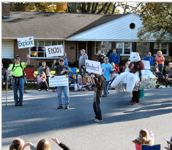
Lancaster Group Members in the Millersville 2014 Parade Displaying the Sierra Club's Motto: Explore, Enjoy, and Protect the Planet

our members. For more details, visit our website, www.lancastersierraclub.org and click on Fundraisers, or email sierraclubevent@gmail.com .