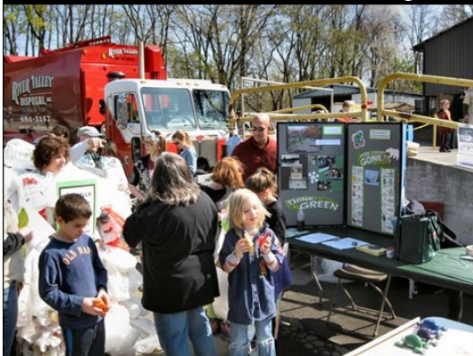
2014 Earth Day Event at Sahd Metal Recycling