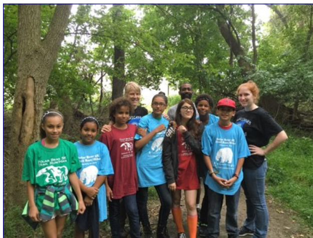
Students lend helping hands to clean up Hand Woods

joined forces in a massive clean-up. The next phase of the project will be to create a second classroom space around a large silver maple and connect the two areas via a path along a stream where a natural bog-type area exists for yet a third area for education. Look for opportunities to volunteer and make a difference for the environment and the community on our website.